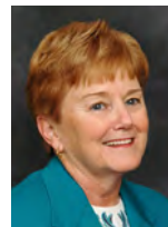
Marlene O'Toole Florida House of Representatives District 42