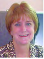
Loretta Costin for Florida Department of Education