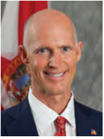
Rick Scott Governor State of Florida