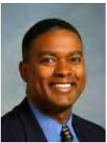
Gerard Robinson Commissioner of Education