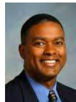
Gerard Robinson Commissioner Florida Department of Education