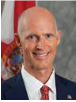
Rick Scott Governor State of Florida